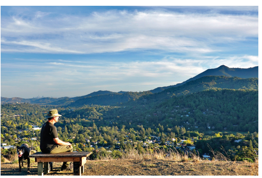
Enjoying the view from Upper Hawthorne, photo by J. Braun

properties to form a large 43-acre park that would protect oak and madrone forests, wildlife corridors, and spectacular views of the Ross Valley and Bald Hill with Mount Tamalpais beyond. It would also allow hiking access from Butterfield Road, continuing through the Town's Kite Hill open space and on to the County's Loma Alta Preserve. If the purchase is completed, MOST will transfer the property to San Anselmo at no cost to the Town. The Town has agreed to accept it. So all that is needed is to raise the necessary funds. A grant application is close to approval. The SAOSC has made a substantial pledge. Generous contributions from neighbors and supporters have already been received. If you would like to see this magnificent new open space preserved, now is the time to make your contribution. 🕶 —Brian Crawford