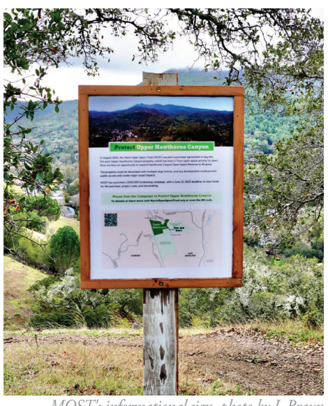
MOST's informational sign